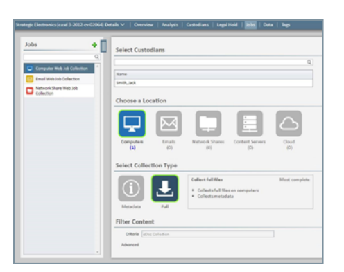
Collection services provide remote and on-site acquisition via EnCase.