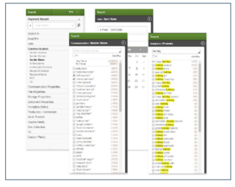
Early case and data assessment services help cull and analyze data sets in Axcelerate.