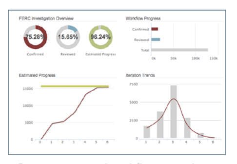
Data science and workflow consulting services efficiently prioritize review in Axcelerate.

OpenText Discovery Professional Services brings together these technologies with the most advanced data hosting, consulting and support for a truly differentiated eDiscovery experience—whether for a specific task, complete individual matter or entire litigation portfolio.