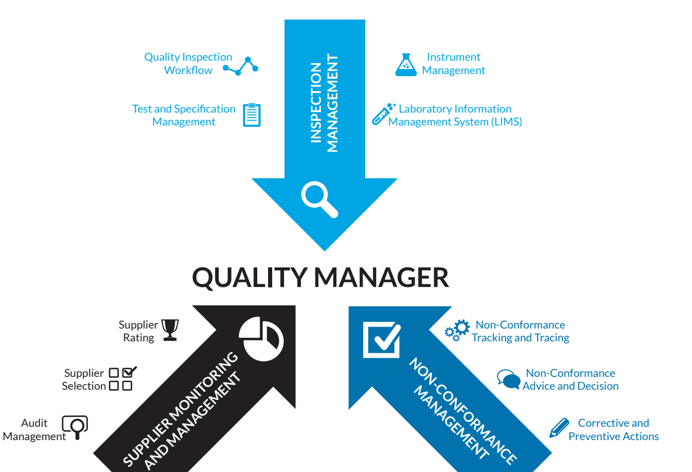
Quality Manager provides a comprehensive suite of functions that enables you to implement Quality Control and Quality Assurance throughout your enterprise